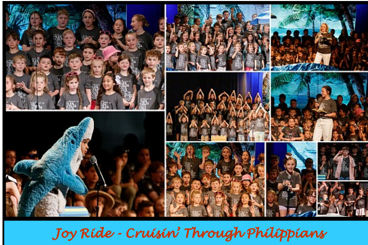
Joy Ride - Cruisin' Through Philipians