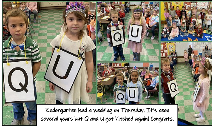
Kindergarten had a wedding on Thursday. It's been several years but Q and U got hitched again! Congrats!

organization that helps those in need in the Lancaster, Berks, Chester, and Montgomery counties. Will you please consider donating to this great cause?