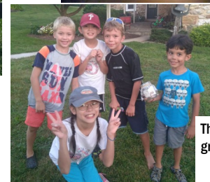
The Younger Generation had a great time too!