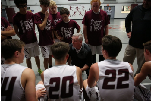
HS Boys Varsity gearing up for a win

the CCAC playoffs for the second consecutive season with a two-point win over Linville Hill in the final contest of the regular season. The Cougars traveled to West Shore Christian and won the quarterfinal matchup 65-52. Conestoga would then face the CCAC east number one seed, Lancaster County Christian, and win 59-51, placing the Cougars in the