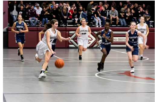
HS Girls Varsity bringing the ball down the court