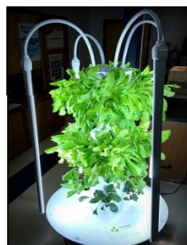
Tower Garden full of leafy greens.

East Penn Manufacturing generously supported our Tower Garden Project with the purchase of a Tower Garden for our science room. The Tower Garden is a freestanding, vertical, aeroponic indoor/outdoor garden that uses technology to enhance the learning experience in the classroom by providing hands-on interactions for our students to learn about plant