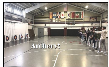
The high school archery class takes aim.