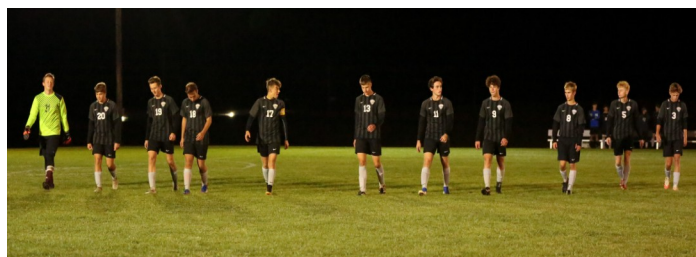
Varsity soccer - Senior Night under the lights