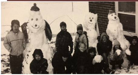
Snow play—kindergarten class of 2002