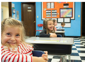
Elementary students excited to learn

In addition to the leadership team at CCS desiring to open in person for the 2020/21 school year, the leadership teams of many area Christian schools felt the same way. Four schools in particular—Berks Christian School, High Point Baptist Academy, The King's Academy, and West-Mont Christian Academy—began collaborating with CCS on “guiding principles” for our schools to open safely and in person. Our schools felt there was strength in numbers and wanted to stand united as Christian schools in our area. I had the pleasure of working with the Heads of Schools virtually throughout the months of June and July. Our five schools adopted the following opening guideline and shared it with each of our communities: