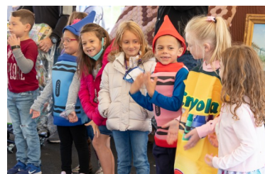
CCS was blessed with a beautiful day for the 47th auction - outside under the tent.

classes. Have we had some Covid cases on campus? Yes, we have had some cases; some students and their families contracted Covid as have a few of our teachers, but everyone recovered well and is healthy—praise God! Have there been adjustments to classroom schedules and classroom configurations? Yes, we have adjusted operations on campus; one example of change is that some students eat lunch in their rooms while others continue to eat in the gym, but our students appreciate receiving instruction in person from teachers who loves