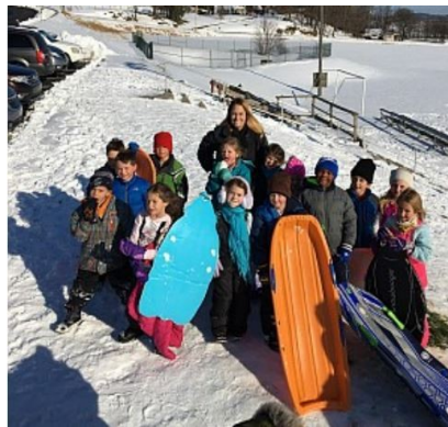
Current first grade class sledding at recess