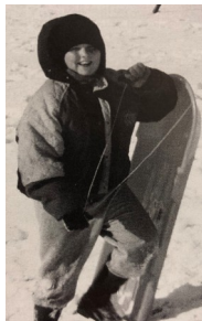
Fourth grader sledding in 2002

Sledding down the back hill and playing in the snow during winter days have been activities that elementary students have enjoyed for as long as anyone can remember. That tradition was enjoyed this year as well! Right before the Christmas break, many